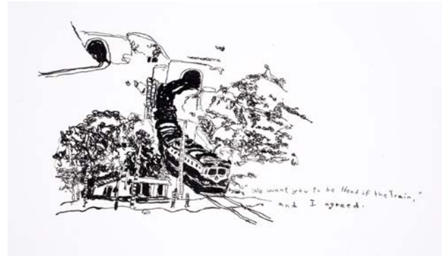
"Head of Train.", 2011, Oil stick on paper, 27" x 22"