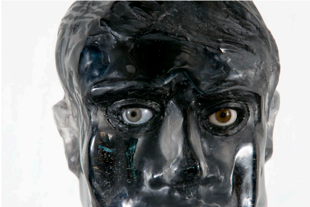
detail, 2010, lead crystal

5:00CONTACT: Monica LaStaiti, Ed Gilbert