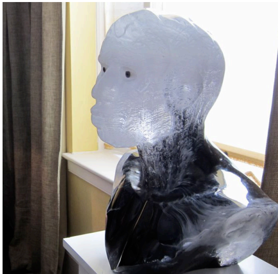
detail, 2010, lead crystal

Gallery Paule Anglim is pleased to announce an exhibition of new works by Carter , our second presentation at the gallery since his debut show here in 1997. Carter will exhibit two crystal heads on wood pedestals-- life-size portrait busts in hand-formed glass.