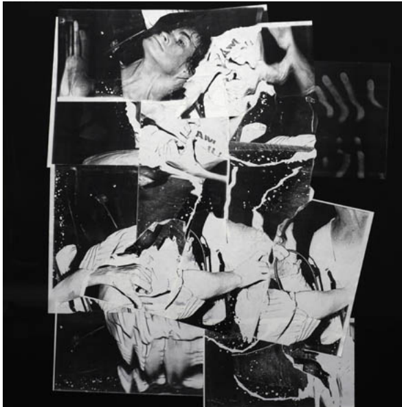
Bruce Conner, ILL JUNE 1987, 1987 Photocopy collage, 58 x 39 ¼ inches (DETAIL)